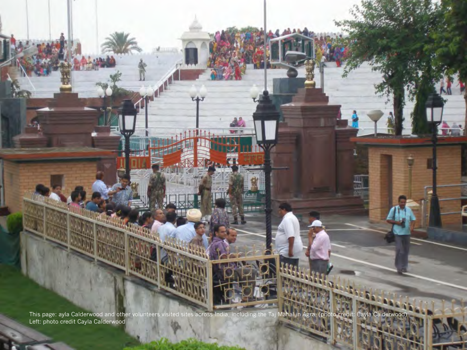
This page: ayla Calderwood and other volunteers visited sites across India, including the Taj Mahal in Agra. (photo credit: Cayla Calderwood) Left: photo credit Cayla Calderwood