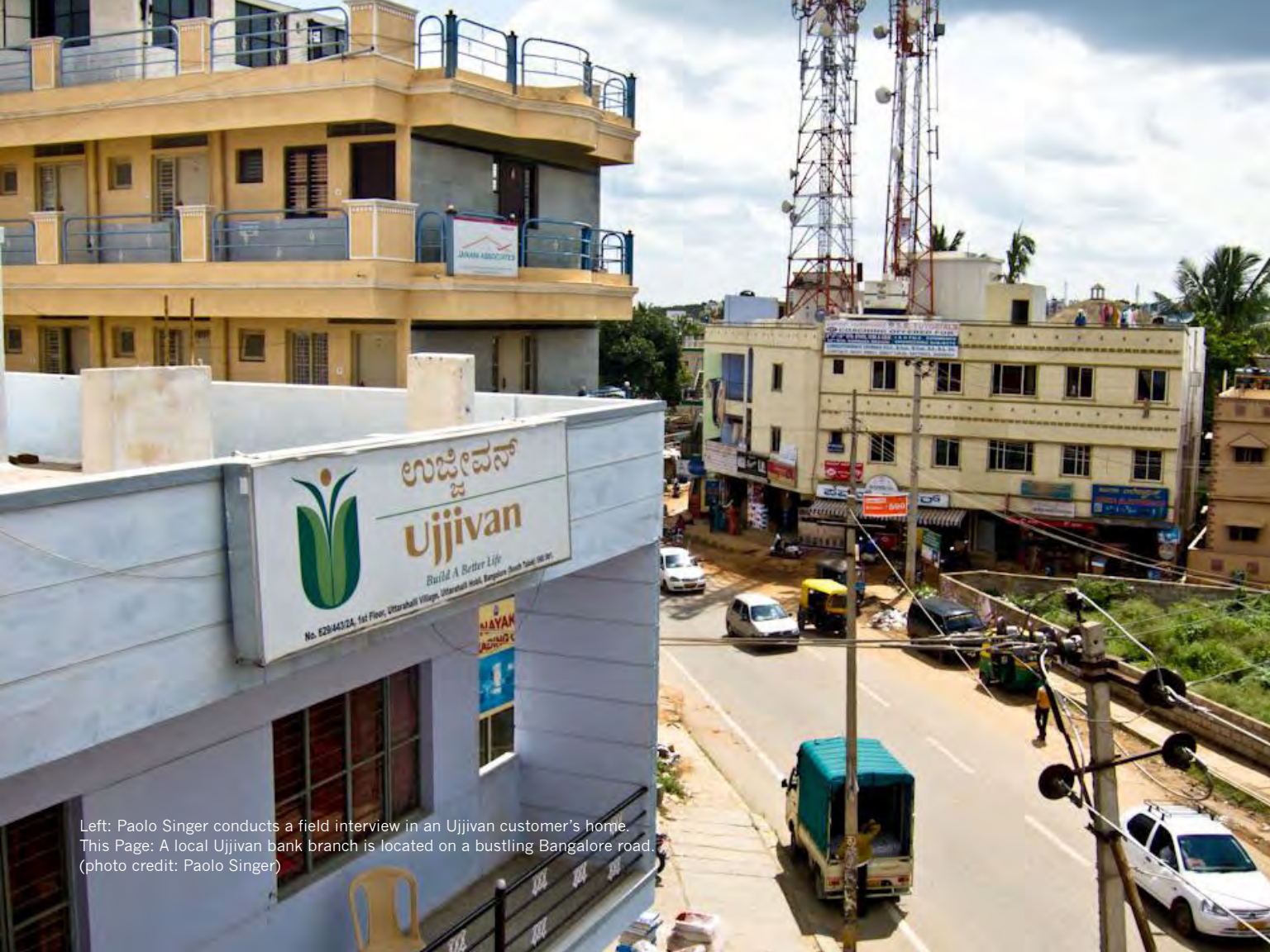
Left: Paolo Singer conducts a field interview in an Ujjivan customer's home. This Page: A local Ujjivan bank branch is located on a bustling Bangalore road.