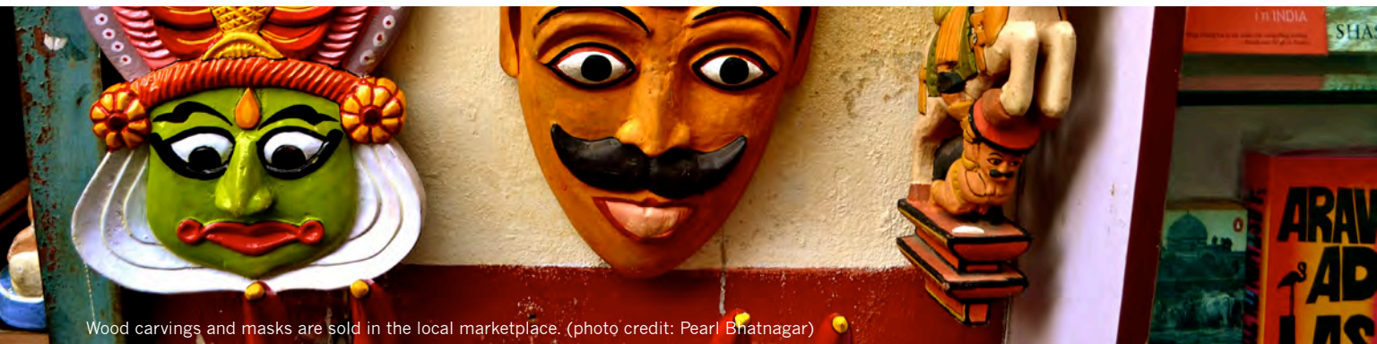
Wood carvings and masks are sold in the local marketplace.

We were buying cloth at the local marketplace in India. We bickered about prices and colors and textures in accents different from the ones the locals would bicker in so the elderly man whose sons ran the shop asked us where we were from. In my broken Hindi, I told him we were Americans and in his Urdu, he asked us where we worked. We told him we worked at a microfinance institution that gave loans to women who could not receive them from banks. He was so impressed that we were doing something socially conscionable that he asked two Americans to break his Ramadan fast with him and share in his only meal of the day.